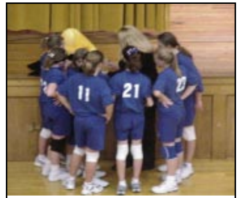
Our volleyball team

On behalf of our students and faculty, may we wish you all the blessings of Christmas. Our Savior is born! May God's gift of salvation in Christ fill you with peace and joy as you witness His love and the greatest gift of all - Jesus!