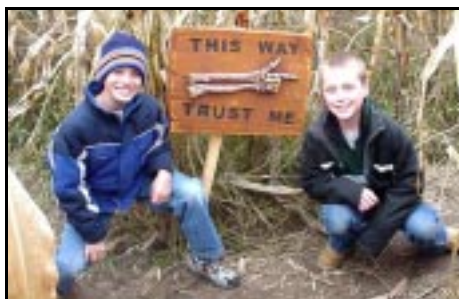
Leaman's Green Applebarn