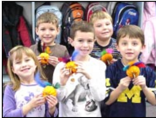
Showing off our turkey pumpkins!

Mrs. Diehl brought in miniature pumpkins for us. We decorated one pumpkin as part of our Fall Festival