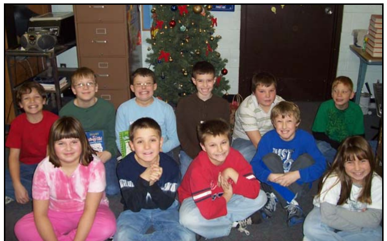
GLEDHILL GATOR'S AROUND THE TREE

We wish blessings to all through this season of Christmas.