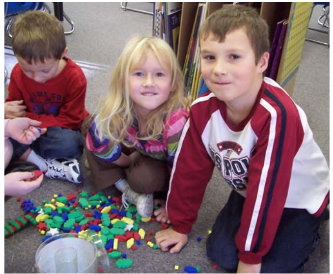
MAKING DECORATIONS FOR THE CHRISTMAS TREE

We pray God's blessings on all of you throughout this holi-